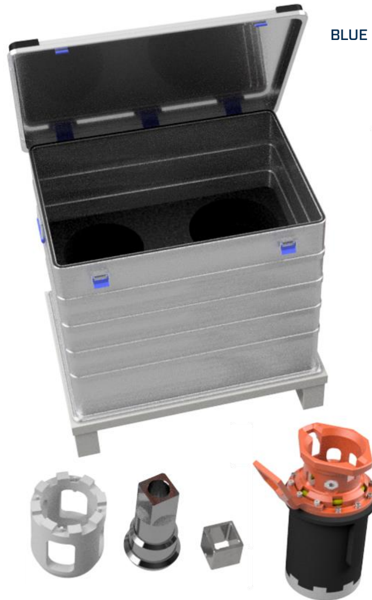
BB2408 Class 6&7 Gearbox Kit

1: Other gear ratios available upon request