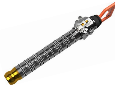
BB2899 Ø63/Ø65 ValveStab