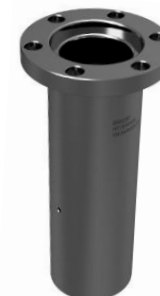
BB5539 Parking Receptacle