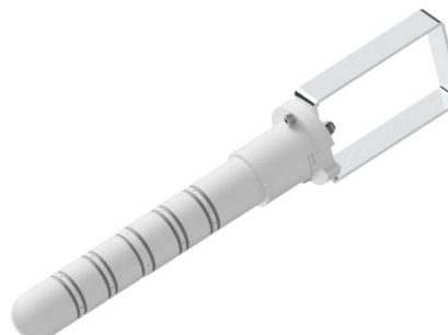
BB5537 Ø63/Ø65 Flushing Stab, for flushing of receptacle