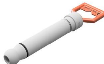
BB5536 Dummy Stab